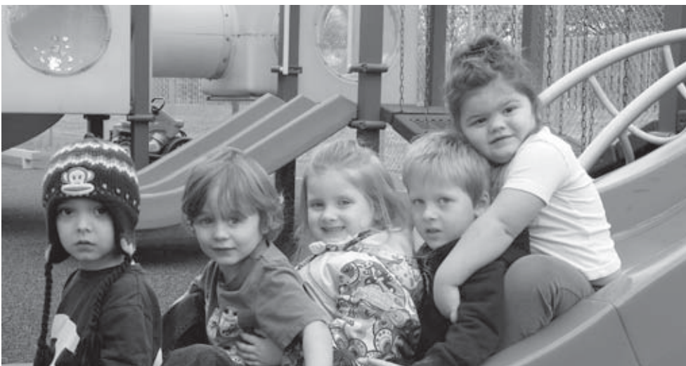
District Program Center Playground, Cottage Grove

The annual ECFE children's garage sale offers clothing, books, toys, furniture and equipment. Participating in this popular community event is a great way to clean out your closets and discover new treasures. You can buy, sell or donate! Watch for more information on how to participate at www.cecool.com , ECFE/School Readiness Annual Garage Sale.